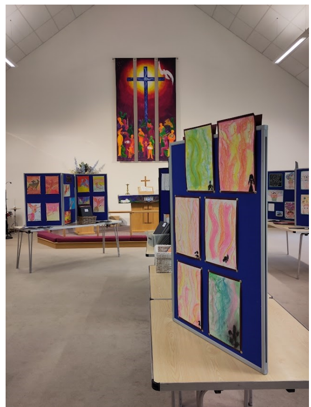
School Art Exhibition